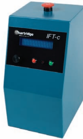
Figure 2 IFT-C