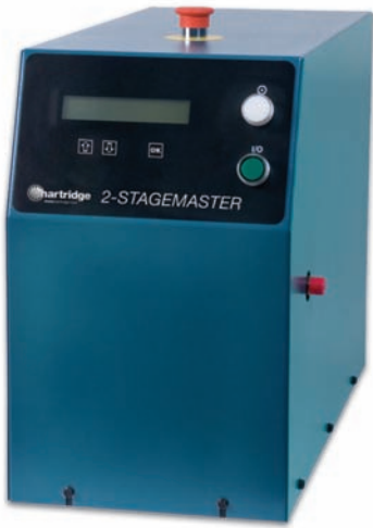
Figure 1 2 Stagemaster HH720.